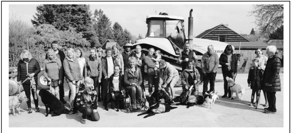
Photo above – The Wag and Walk event, which started from the Shoot Room on Sunday 23 rd April 2017.

PS my mum says I should tell you that her life is so much easier again now, and she doesn't feel anything like as disabled. Knowing that makes me wag, a lot - it's what I'm here for.